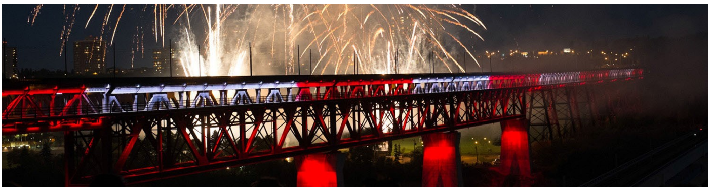
The High Level Bridge in Edmonton, AB is lit up for Canada Day!