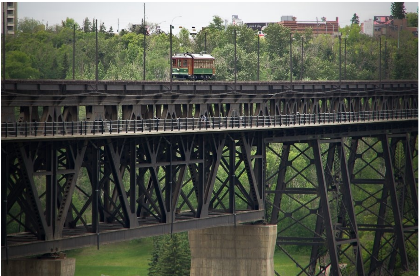
An historic streetcar goes over the top of the High Level Bridge in Edmonton, AB