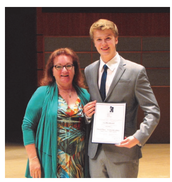
DONOR Pickering GTA Music Festival, ON