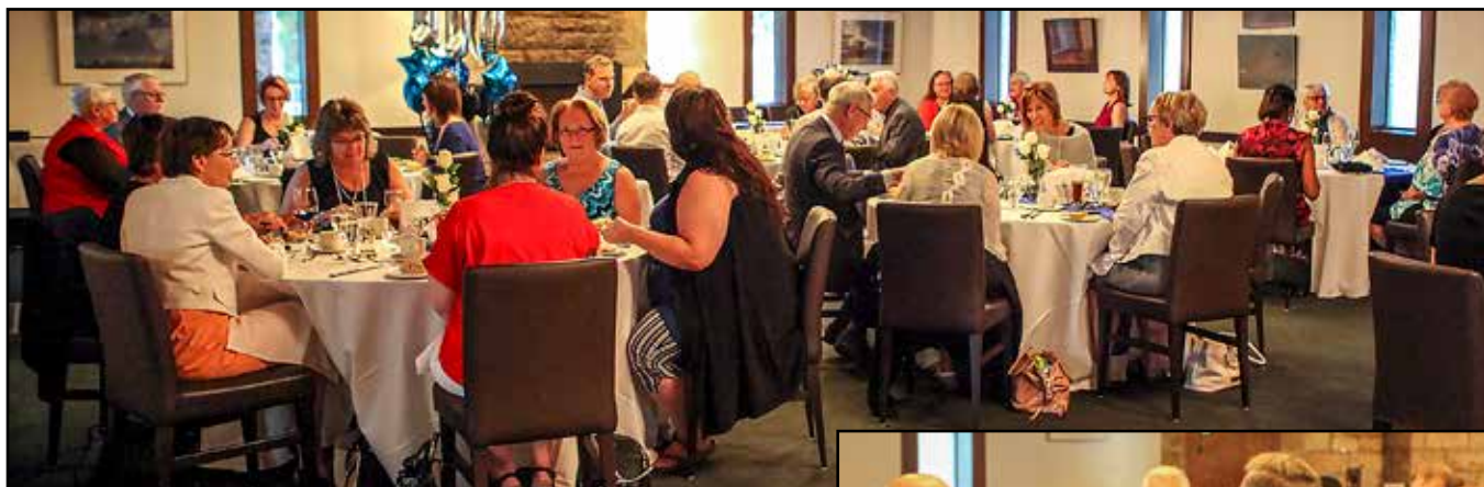
Wednesday evening, the historic University Club was the venue for a formal Federation Dinner.