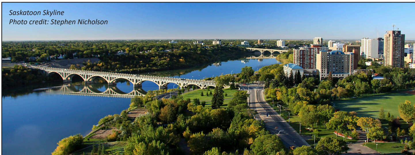
Saskatoon Skyline