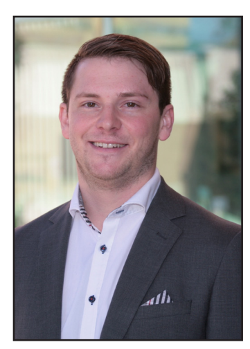
Voice / voix Spencer McKnight, SK Donor/donateur: Fredericton Music Festival, NB Performing Arts BC Festival Society